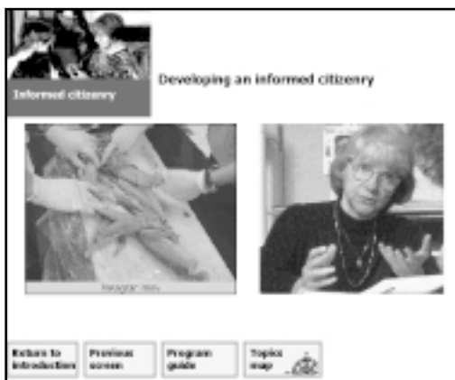
Photos and Video Screen