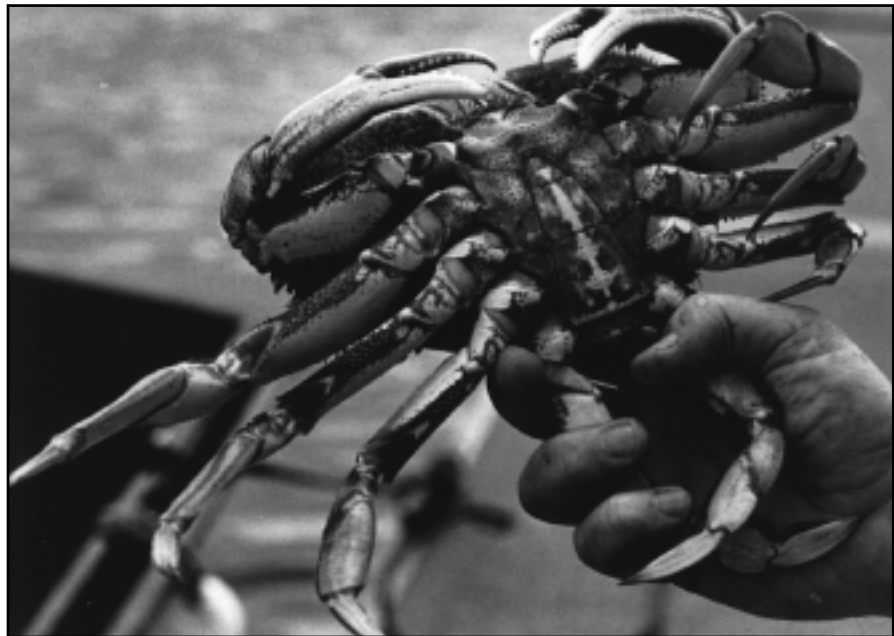
Figure 3. To avoid getting pinched, quickly grasp both of the crab's rear legs or the rear central portion of the shell.

ring net, pick up your floats and gather in the line.