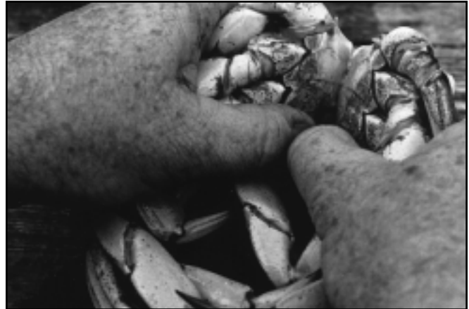
Figure 7. Fold to break in half and shake out viscera from each half.

cooking. While this discoloration isn't harmful in itself, it does indicate that the crab hasn't been adequately cooked.