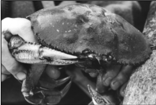
Figure 6. Remove the back by forcing the edge of the shell against any solid object.