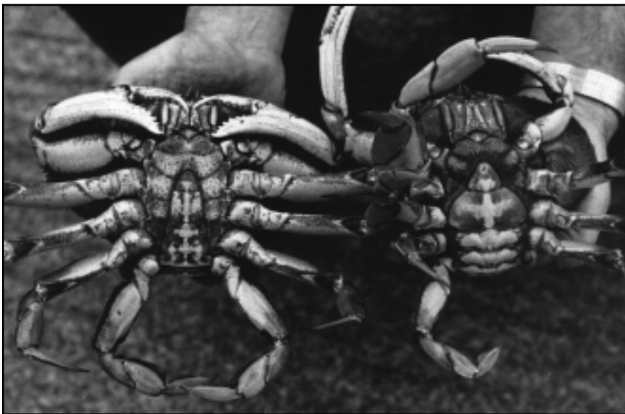
Figure 5. Male Dungeness crab (left) has a narrow abdomen, or shell flap, on the underside. Female (right) has a broad abdomen. Release all females.

Crab size is measured in a straight line across the back and immediately in front of but not including the points (see figure 4). Retain only hardshell crabs of legal size and sex.