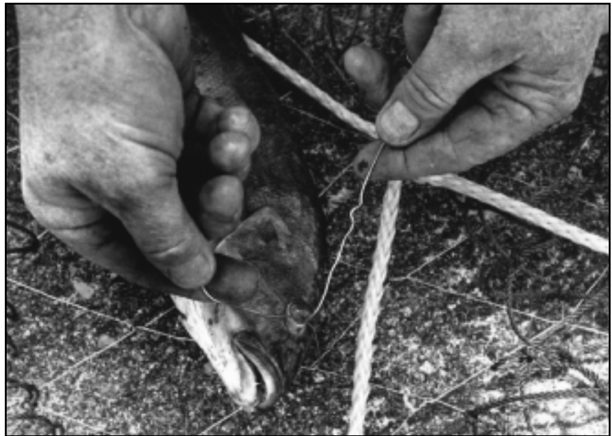
Figure 2. Fish carcasses make good bait; you can attach them with wire to your crab ring net or trap.

Always approach floats against the tidal current. As your boat nears the