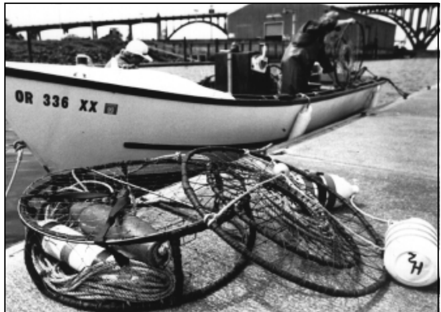
Figure 1 A crab trap (left) is bulkier than a crab ring net (right), but you can leave the trap unattended longer without fear of losing your crabs.

Eggs are carried under the female from December to March; they hatch from March through May.