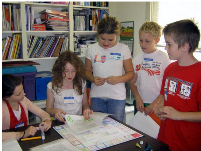
Students in Jennifer England's fourth-grade class work on an invasive species public-information project.

The students' six-week dedication to aquatic invasive species helped the class develop research and public presentation skills, England said. "It blossomed into more than I expected."