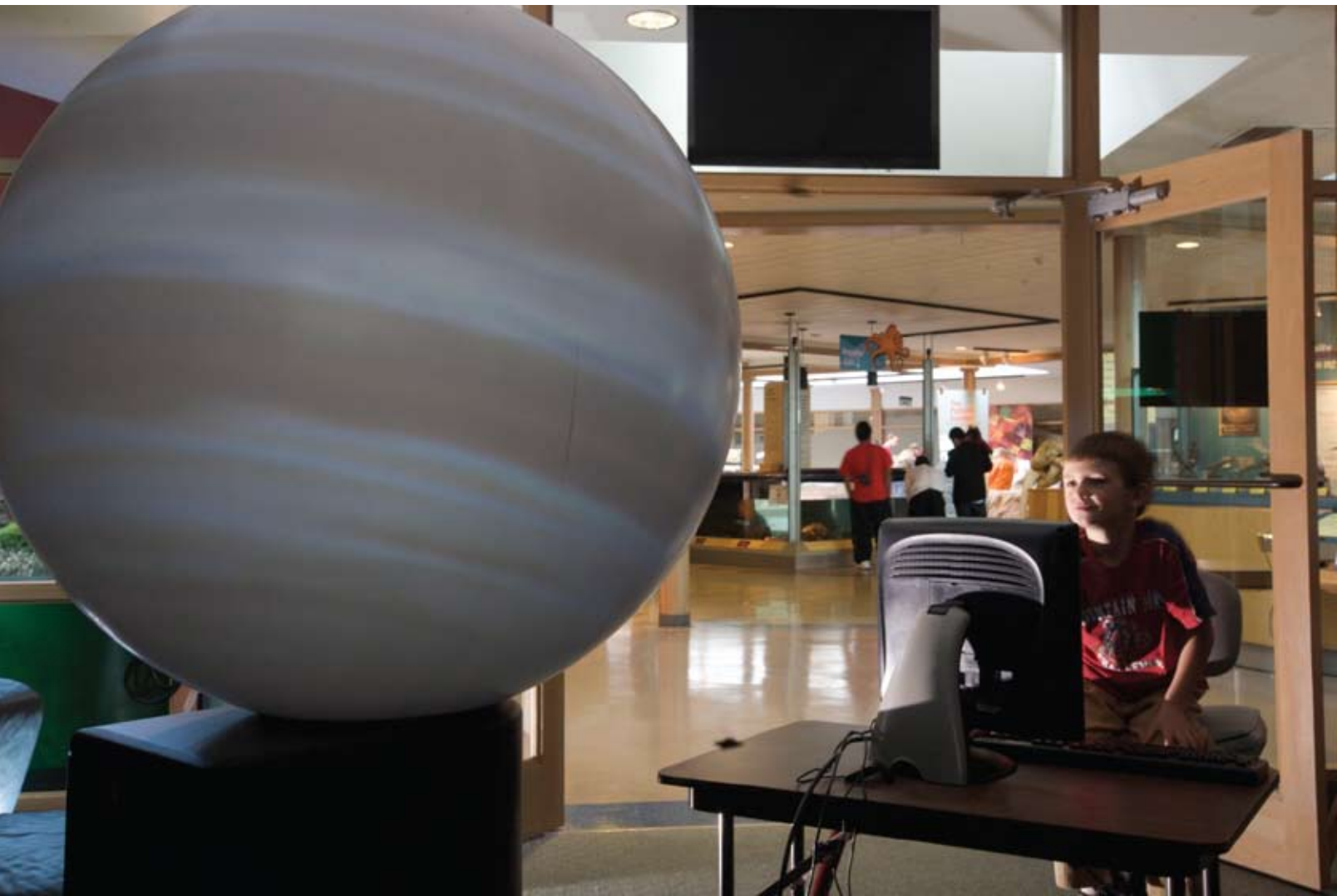
The Magic Planet, a spherical display for digital data about planetary dynamics, is one of the exhibits being tested and refined by OSU free-choice learning scientists.

offering learning opportunities for free-choice learners of all ages. Hoping to better coordinate this multi-limbed beast, OSU is partnering with several organizations — the Association of Science-Technology Centers, the University of Pittsburgh’s Center for Learning in Out-of-School Environments (UPCLOSE), and the Visitor Studies Association — to create a new national Center for the Advancement of Informal Science Education (CAISE). Funded by the National Science Foundation, the center will extend the scope and awareness of out-of-school learning. OSU’s free-choice-learning researchers want people to know that a science educator isn’t just the biology teacher at the high school but also the aquarist who gives “pond classes” for adults raising koi in their backyards. Or that a learning environment isn’t only a college engineering lab but also a wave-energy exhibit at the coastal visitor center.