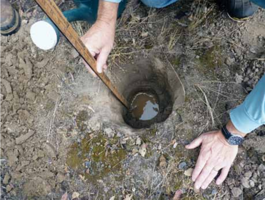
A shovel was used to dig most of the way, then a 6-inch-diameter post-hole digger was used to reach the proposed bottom elevation of a rain garden. Measure the drop in water from a known, stable marker.