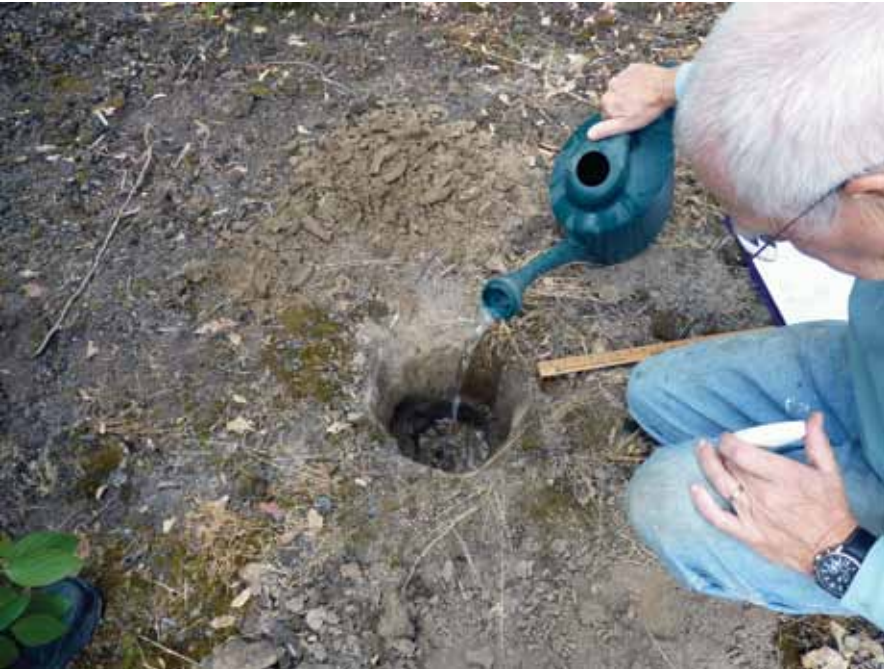
Add water carefully so that the hole doesn't cave or the sides and bottom don't erode. In clay soils, the clay can re-sort to clog the bottom and give artificially low infiltration rates.

Do not add water in the last 30 minutes of the soaking hour. If the pit contains no water after the 30 minutes, use a 10-minute measurement interval for testing. If water remains in the pit, use a 30-minute interval (SEMCOG 2008). In Oregon, where soil is a mixture of clay and sand, the clay particles can easily be suspended in the presoaking water and clog “or cement up” the sides of the facility. These soils may also cave, and indicate that another location on-site should be investigated, since these soils will likely fail in the same way once an infiltration facility is built over them.