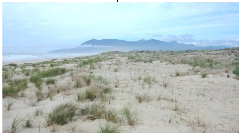
Nehalem Bay, OR

Hybrid - An organism produced by the breeding of two different parent species (in the case of the beachgrasses), or of genetically distinct populations within a species.