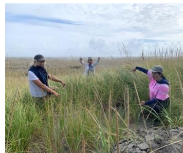
of hybrid beachgrass.