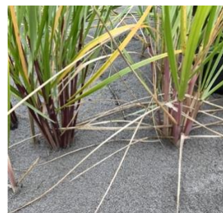
Hybrid beachgrass (L) next to American beachgrass (R)