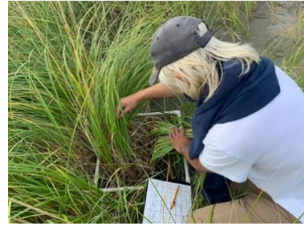
Researcher counts beachgrass stems

In the last decade, a hybrid beachgrass was discovered by researchers. The hybrid was formed through the accidental breeding of its parent beachgrasses. While little is known about the hybrid beachgrass, research shows that it has certain traits, such as stem height and density, that are often greater than its parent species. Because taller and denser beachgrasses are associated with taller dunes, the hybrid has the potential to form larger dunes that protect better against sea level rise and storms. However, the hybrid may continue to outcompete native dune species and drive their decline. This hybrid represents the ways that humans can influence their environment and how the environment then affects us, often in ways that are unexpected and rarely straightforward.