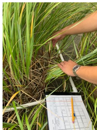
Counting beachgrass stems