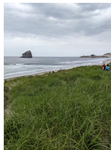
Students collect data during a field trip