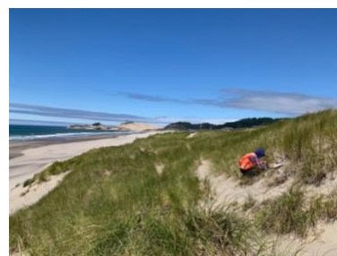
Studying beachgrasses in Pacific City, OR