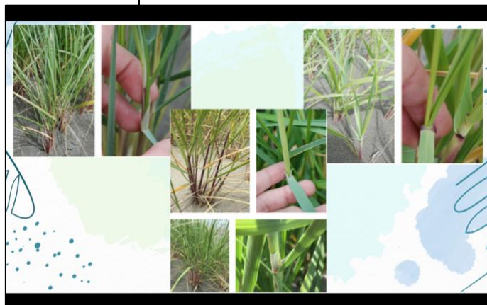
Slide from “Discovering New Organisms” showing three types of beachgrasses