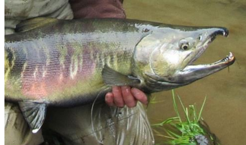
Chum salmon