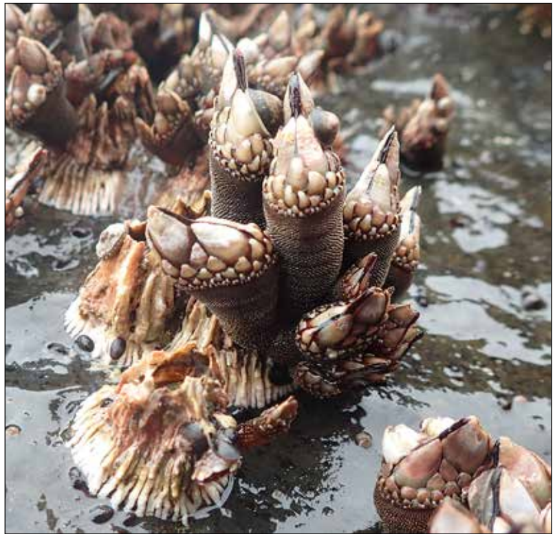
Gooseneck barnacles grow on top of thatched barnacles.

He added that unlike high-flow systems, his low-flow "barnacle nursery" doesn't use as much energy or have expensive pumps