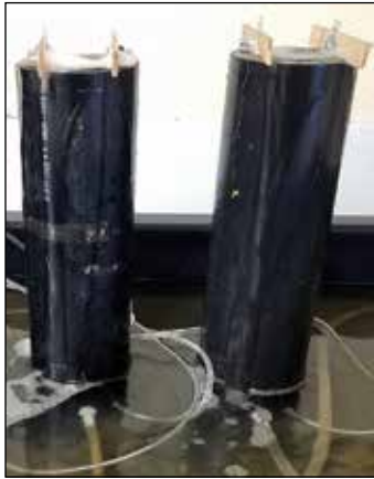
Seawater is pumped into plastic tubes containing juvenile gooseneck barnacles. Researchers glued the juveniles to textured, acrylic plates hung vertically inside the tubes.

Another part of Shanks’ project involved conducting field research to see if there are enough gooseneck barnacles in southern Oregon to sustain commercial harvesting. The Oregon Department of Fish and Wildlife allows commercial harvesting of gooseneck barnacles on jetties but not on natural rock formations. Shanks hopes the agency will be able to use the results of his work when regulating their harvesting.