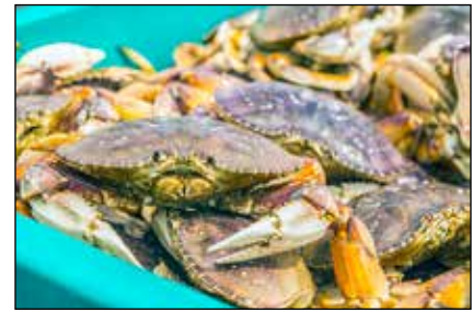
Dungeness crabs are fresh off a commercial fishing boat in Newport, Ore.

During the 2016–17 season, fishermen in Oregon landed 20.4 million pounds of Dungeness crabs, which they sold for a record $62.7 million, according to the Oregon Department of Fish and Wildlife. Dubbed the official state crustacean, Dungeness crabs make up the most valuable single-species commercial fishery in Oregon.