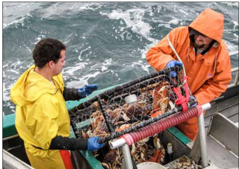
Crew members on the Delma Ann haul in a crab pot and hit it against a banger bar to force the crustaceans out of the pot. Because of a fisherman’s suggestion, researchers are looking for ergonomic banger bars.

“...the goal is that the solutions are voluntarily embraced and are not imposed.”