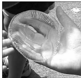
A water jelly, Aequorea , in a child's hand

Velella is not the only jellyfish you might find on your beach walks. The water jelly, Aequorea , usually appears as a flat, clear blob with distinct and numerous rib-like radial canals. It can be spotted in the water at night as a bright, pulsing ball of light caused by its own bioluminescence. West coast sea nettle ( Chrysaora fuscascens ) is tan with reddish-orange hues and has very long tentacles. Its sting can be mildly harmful to humans, about as potent as a bee sting.