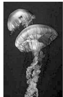
West coast sea nettle, Chrysaora fuscascens

This publication was funded by the National Sea Grant College Program of the U.S. Department of Commerce's National Oceanic and Atmospheric Administration, under NOAA grant number NA16RG1039 (project number A/ESG-5), and by appropriations made by the Oregon State Legislature. The views expressed herein do not necessarily reflect the views of any of those organizations.