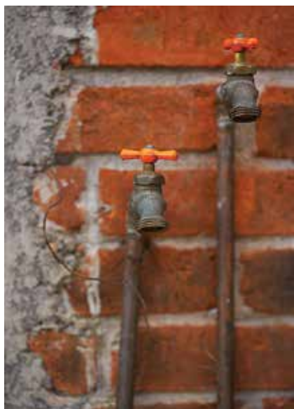
Nearly all of the system managers interviewed perceived their drinking water system infrastructure as a major risk.

Coastal storms. A few system managers identified coastal storms, and in particular, storm surges, as a risk. While most did not express concern with sea-level rise, saltwater contamination from storm surges was expressed as a risk. A few of the systems have had to abandon one or more of their sources due to high salinity levels. One system manager discussed how landslides could isolate the community, cutting off emergency access, including backup water supplies. Another saw long-term power loss as a risk, as its distribution pipes traverse varied topography, thus requiring energy to pump it upslope.