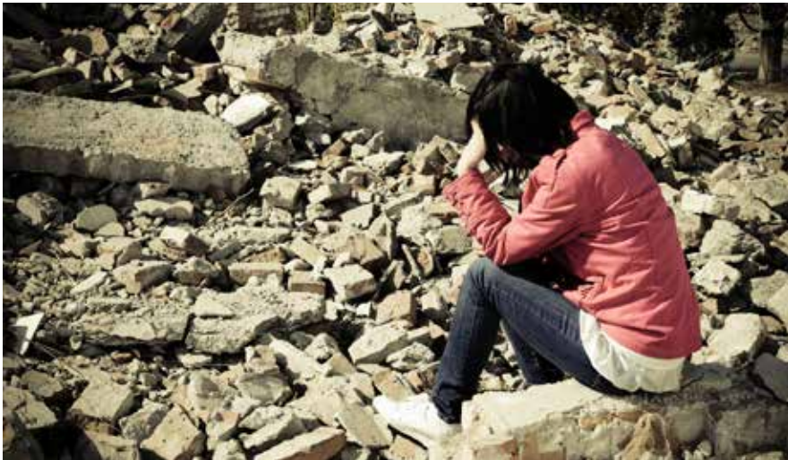
A Japanese girl despairs after the 2011 tsunami. An earthquake and tsunami in Oregon could damage the water distribution infrastructure and affect water quality.

option to afford; (2) the amounts available aren't enough to make a dent in the needed improvements; and (3) there are too many strings attached and steps involved for capacity-limited systems.