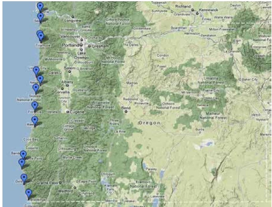
Geographic locations of community drinking water systems represented in interviews.

were interviewed, ranging from Astoria in the north to Brookings in the south. The systems served populations from 500 to 9,500 individuals, with the majority relying on surface water for the primary source. The map above shows the approximate geographic locations of the systems along the Oregon coast. Table 1 (next page) describes the general characteristics of each community system sampled.