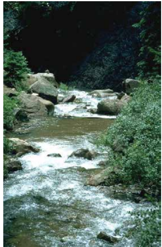
Small systems often cannot accommodate water with heavy sediment loads, which frequently occurs following exceptionally heavy precipitation events.

is under different ownership than the water systems that rely upon it. In addition, there are limited regulations on private forest practices as they affect water quality. While purchasing upstream pieces of land is an option for some systems, others lack the resources to do so—which is unfortunate, as this type of source-water protection is often viewed as the most effective step toward achieving optimal water quality at the tap (Freeman, Madsen, and Hart 2008).