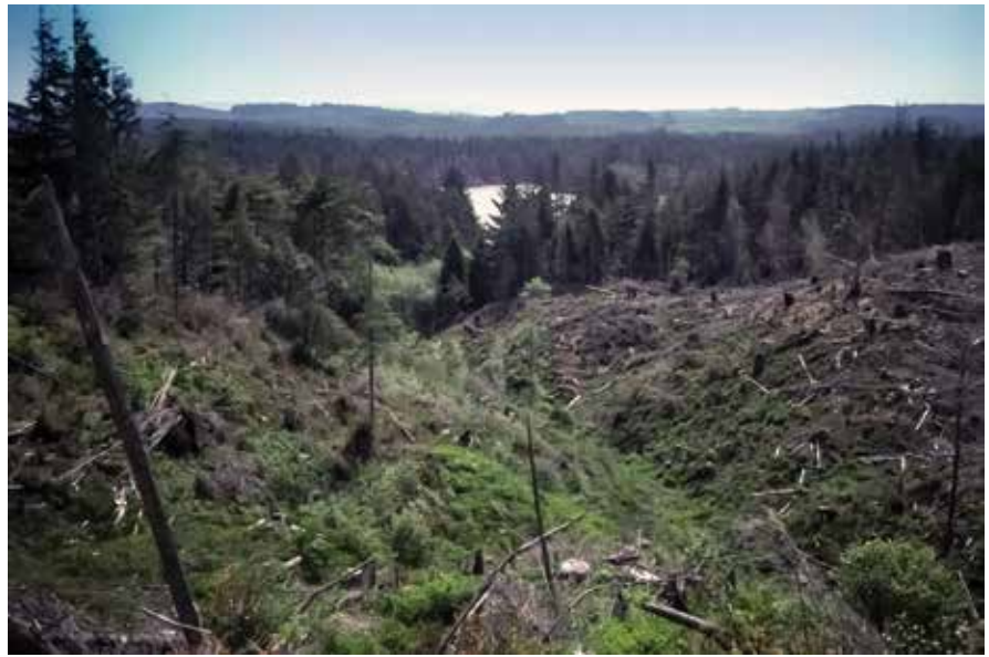
Forest management practices were by far the most commonly reported risk related to land use.

Land use. Next to infrastructure, interviewees expressed the greatest con-