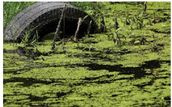
An emerging risk that may be indirectly tied to climate change is algal blooms.

A final risk related to capacity was reported by one system: in times of crisis, backup assistance is not close at hand. Small, isolated places—a description that fits many of the communities interviewed—have to rely on skilled staff in other towns for help. Bigger cities inherently have higher capacity to deal with emergencies because of the greater number of skilled staff overall.