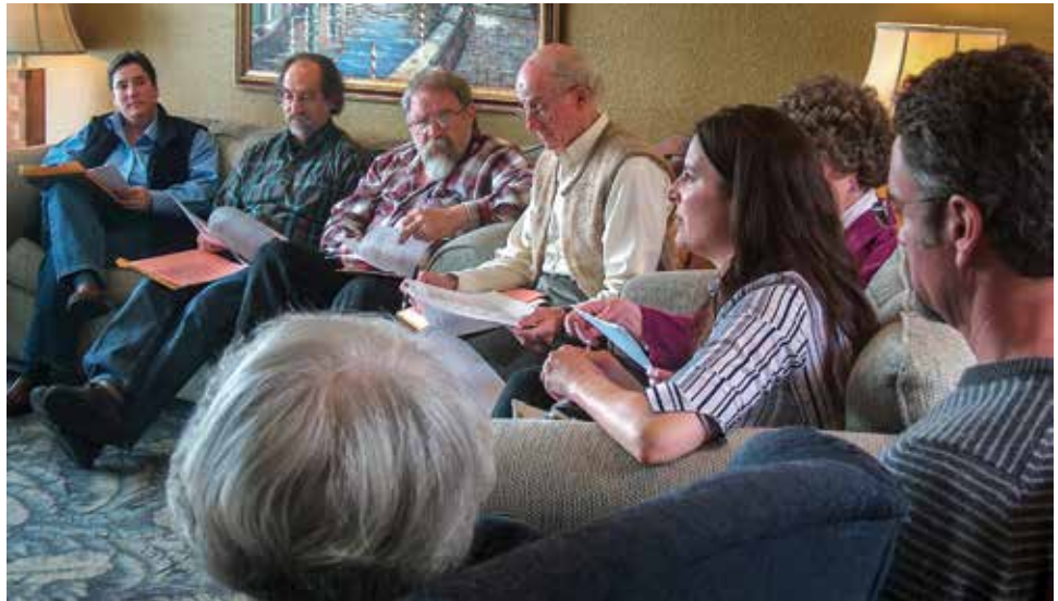
One of the first recommendations for future research includes workshops with the public, water-supply officials and planners, and local climate-change experts to exchange information and communicate risk.

The first recommendation for future research is thus to gain a better understanding of risks to coastal community water supplies, which could be achieved through three steps: (1) a follow-up survey of a broader representation of the same population, as Morgan et al. (2005) recommend for the risk communication method; (2) interviews or surveys of coastal planners who are responsible for devising community adaptation plans; (3) surveys with the general public in coastal communities to better gauge their understanding of risks; and (4) workshops with the public, water-supply officials and