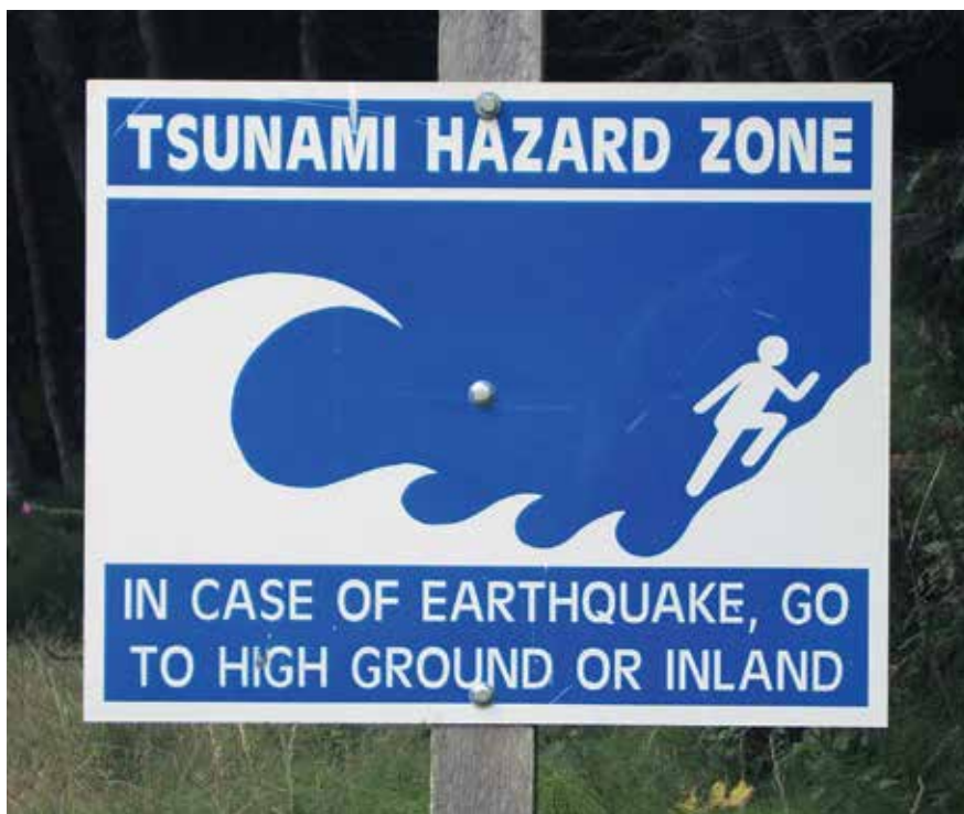
While distant tsunamis pose a risk to water quality, a local tsunami event could devastate coastal communities that are not prepared.