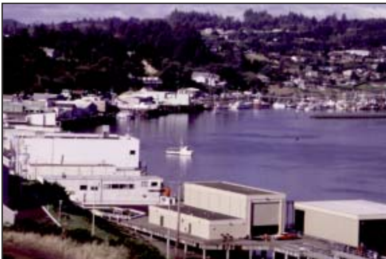
Newport bay front

Newport's 1997 population was 9,960, 18 percent more than in 1990. Many workers are employed in industries with seasonal unemployment, including farming, wood products, and tourism. The top five manufacturing employers in Newport are Ocean Beauty Seafoods (500 employees), Newport Shrimp Co. (250 employees), Depoe Bay Fish Co. (210 employees), Mo's Enterprises (65 employees); and Alsea Veneer (65 employees). Median family income in Lincoln County was 88 percent of the state average.