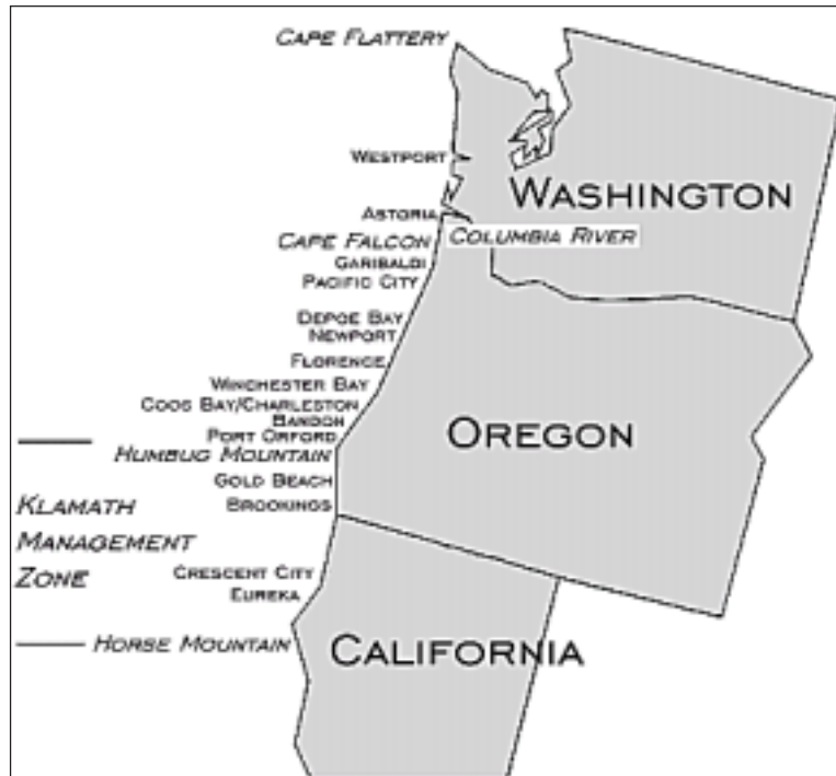
Figure 1. Northwest coastal commercial fishing communities

Sustainability can have a number of meanings, depending on what people value (Gale and Cordray 1994). It may mean maintaining long-term viability, minimizing human impacts on ecosystems, or sustaining growth. Usually, it means being able to continue living in a habitat or using a resource in the same way well into the future. In fisheries, sustainability has been defined as fishing at the level of maximum sustained yield (MSY).